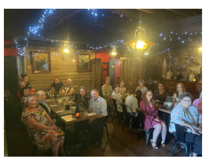
Carers in Launceston celebrating at Kings Bridge Restaurant

FKAT were thrilled to host over 120 carers across the state for our Christmas celebration lunches in all regions. A very big thank you to those who came along and enjoyed the end of year festivities. FKAT board and staff appreciate that it is a very busy time of year for carers and it is so great that we could all get together to celebrate the year that was 2023.